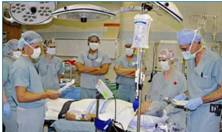
A surgical team goes through the Surgical Safety Checklist.